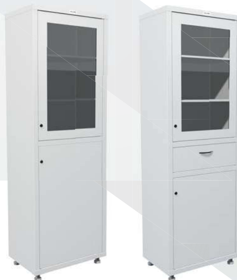
MD 1 1760R-1