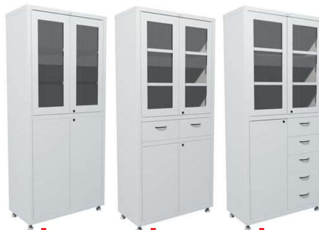
MD 2 1780R-5

In the Lower compartments MD 2 1780R has two lockable metal doors with two shelves.