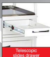
Telescopic slides drawer