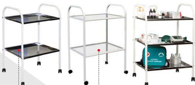
MD SP 3N