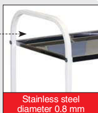
Stainless steel diameter 0.8 mm