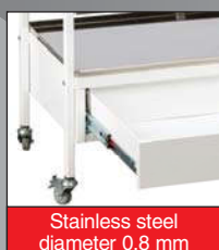
Stainless steel diameter 0.8 mm